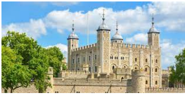
The Tower of London,