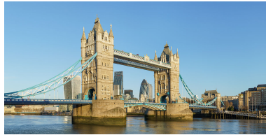
the Tower Bridge,